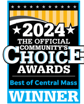
Winner: Best Credit Union, Best Financial Planning Services - The Official Communities Choice Awards