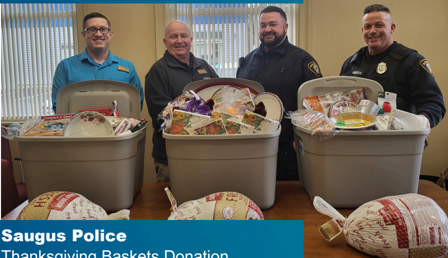
Saugus Police Thanksgiving Baskets Donation