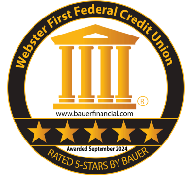
Rated 5-stars by Bauer Financial