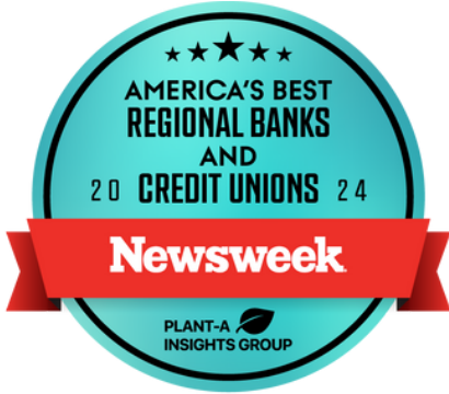
Newsweek's Best Regional Banks and Credit Unions